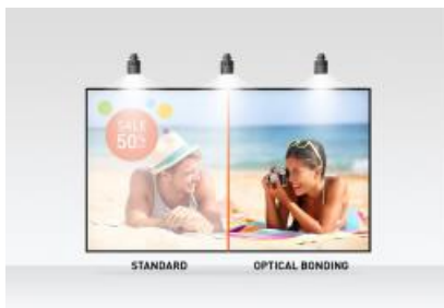
Optical bonded PCAP

The Full HD (1920x1080) Open Frame monitor ProLite TF2238MSC-B1 with IPS panel technology offers exceptional colors and wide viewing angles. The Optical Bonded Projective Capacitive (PCAP) 10-point touch technology ensures a seamless and accurate touch response and a lower light reflection, in addition, the display is protected against humidity and potential moisture development. A robust metal housing and a scratch-resistant 7H edge-to-edge glass with anti-fingerprint coating make the monitor particularly suitable for integration in demanding environments. The monitor meets also a IPX1 protection rating, making it waterproof for a period of time against dripping water. The ProLite TF2238MSC-B1 can be used in landscape, portrait and face-up orientation. A perfect solution for kiosk systems, retail and interactive digital signage installations.