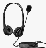
HP Stereo USB Headset G2 428H5AA