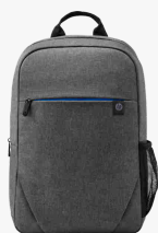
HP Prelude 15.6-inch Backpack 2Z8P3AA