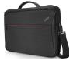
ThinkPad 14-inch Professional Slim Topload