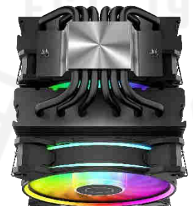
6 Heat Pipes Design

Upscale design featuring aluminum top cover and signature logo