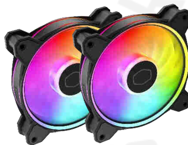
Dual Redesigned Halo 2 Fan

Intuitive LED detection automatically provides default ARGB spectrum lighting or full ARGB customization via 3-pin header connection