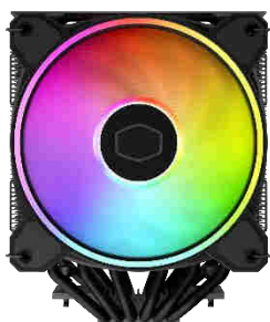
ARGB Auto Detection

Intuitive LED detection automatically provides default ARGB spectrum lighting or full ARGB customization via 3-pin header connection