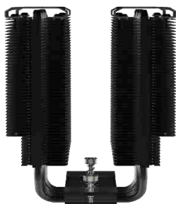
Dual Tower Heat Sink

Low profile heat pipes optimized at 157mm height accommodates most RAM and case requirements