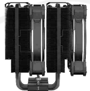
Broad Case Fitment

Dual loop LED 120mm Halo 2 fan features stunning lighting with improved fan performance