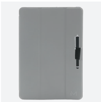
Stylus not included