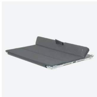
Automatic sleep & wake mode