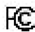
FCC C=2DD B

+9:D 5@4F> 6?E :D L 2023 *92CA %EC D:DA=2J *@=FE:@?D EFC@A6 G> 3H.