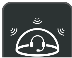
Acoustic Shield Technology