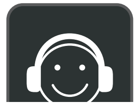
Plug and Play