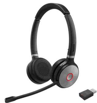
WH62 Dual Portable Teams WH62 Dual Portable UC

Based on hundreds of head form evaluations and thousands of wearing comfort tests, WH62 Portable well meets the ergonomic requirements. Besides, with premier soft leather cushions and lightweight design, you can wear it all day comfortably. For more workspace freedom, WH62 Portable can also free you up to 160m away from the desk.