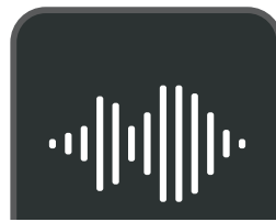
All Day Wearing Comfort