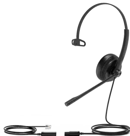
YHS34/YHS34 Lite Mono

Built for comfort with soft ear cushions and ultra-lightweight materials, the YHS34/YHS34 Lite is 10%~30% lighter than other headsets in the same range. Its ergonomic design makes this headset comfortable enough for long conference calls and all day use.