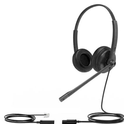
YHS34/YHS34 Lite Dual