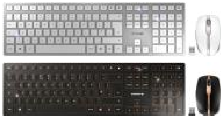
Models may vary from the image shown