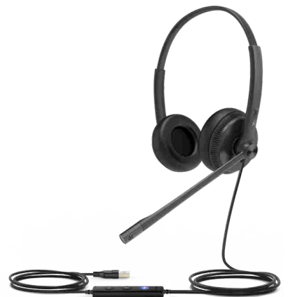
UH34/UH34 Lite Dual Teams UH34/UH34 Lite Dual UC