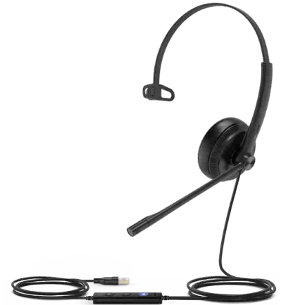
UH34/UH34 Lite Mono Teams UH34/UH34 Lite Mono UC

The hand-held controller with LED indicator provides easier access to key call control capabilities, including answer call, end call, reject call, and mute/unmute.