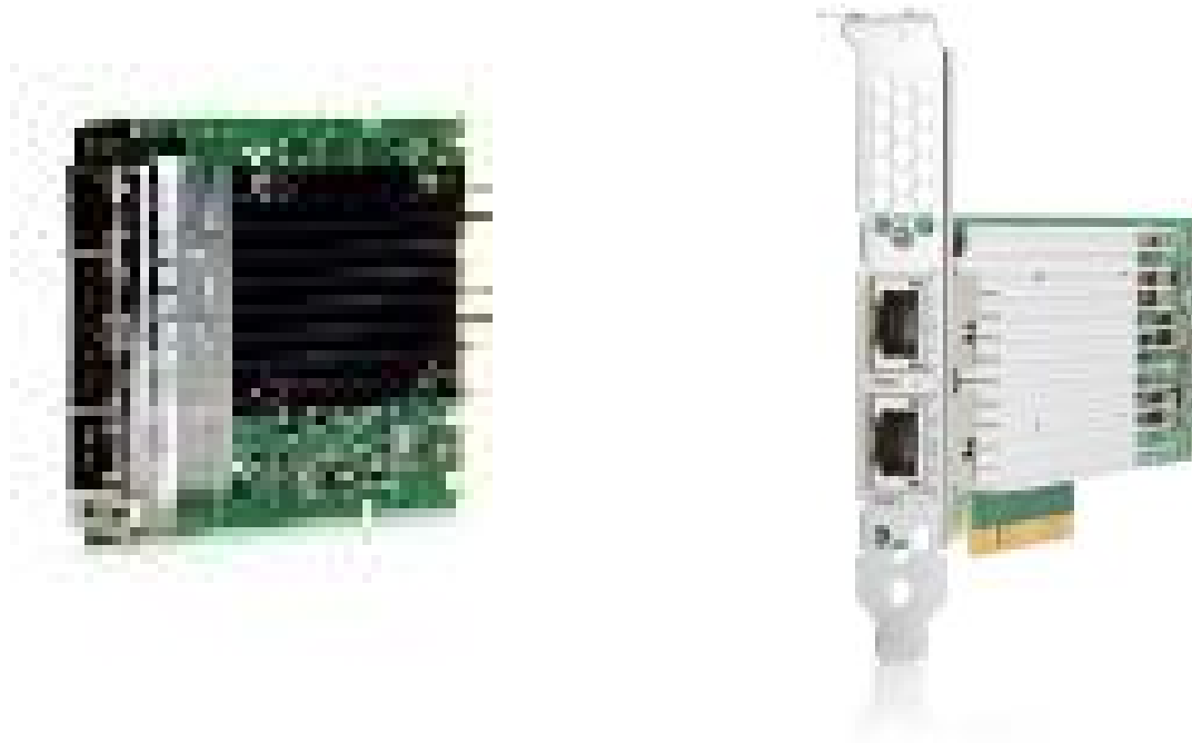
HPE Gen10 Plus Ethernet Adapters

With Gen10 Plus ProLiant Servers, HPE is offering the industry's most secure server platform. Through its Root of Trust server design down to the Network Interface Card (NIC), these security features are built-in so you can deploy with confidence. HPE Gen10 Plus servers will help prevent, detect and recover from cyberattacks such as denial of service and malware-infected firmware. Protecting applications, data and infrastructure from security breaches through storage and networking security technologies is first priority for HPE Gen10 Plus Servers.