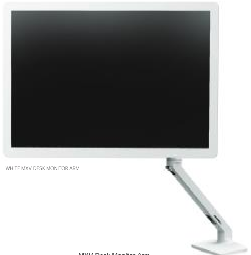
WHITE MXV DESK MONITOR ARM