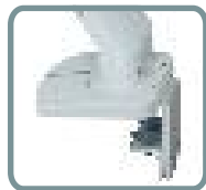
2-PIECE DESK CLAMP ATTACHES TO SURFACE EDGE