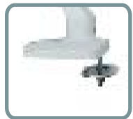
GROMMET MOUNT ACCESSORY (#98-110) ATTACHES THROUGH SURFACE HOLE