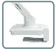
LOW-PROFILE TOP MOUNT C-CLAMP ACCESSORY 45-607-216 (WHITE) / 45-607-224 (MATTE BLACK) ATTACHES ABOVE THE DESK SURFACE