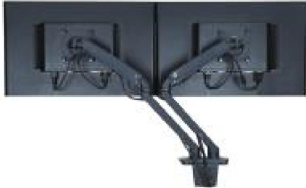
MATTE BLACK MXV DESK DUAL MONITOR ARM