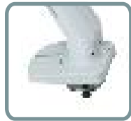
GROMMET MOUNT ACCESSORY (#98-111) ATTACHES THROUGH SURFACE HOLE