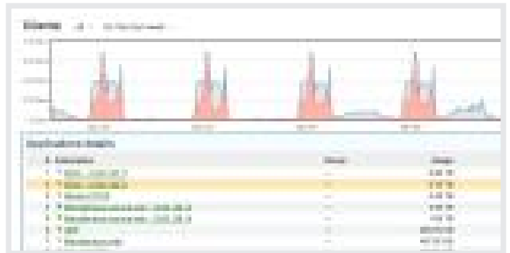
Deep visibility and control over network traffic and Layer 7 consumption.