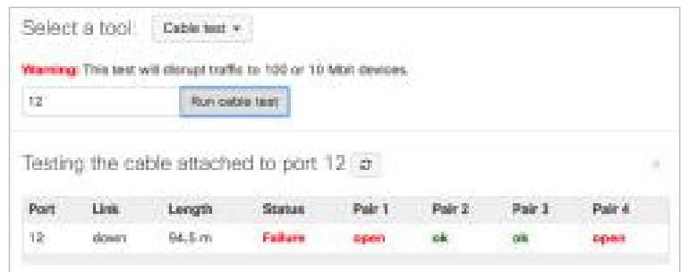
Remote cable test in the Meraki Dashboard

Meraki switches run the same Meraki operating system used by all of Meraki's products. The use of a common operating system allows Meraki to deliver a consistent experience across all product lines. When connected, MS250 switches automatically connect to the Meraki cloud, download configuration, and join the appropriate network. If new firmware is required, this is retrieved by the switch and updated automatically. This ensures the network is kept up-to-date with bug fixes, security updates, and new features.