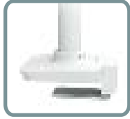
LOW-PROFILE TOP MOUNT C-CLAMP ACCESSORY 45-608-216 (WHITE) / 45-608-224 (MATTE BLACK) ATTACHES ABOVE THE DESK SURFACE