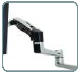
RECOMMENDED ACCESSORY: LX EXTENSION 45-289-026 INCREASES REACH BY 9" (23 CM)