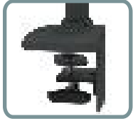
2-PIECE DESK CLAMP ATTACHES TO SURFACE EDGE