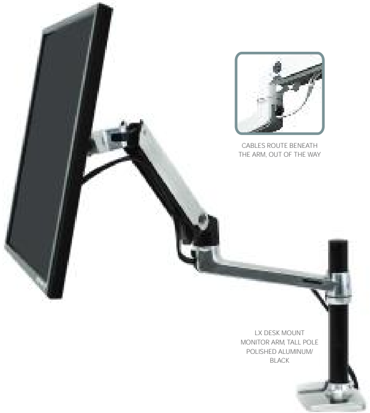
LX DESK MOUNT MONITOR ARM TALL POLE POLISHED ALUMINUM/ BLACK