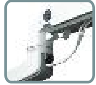
CABLES ROUTE BENEATH THE ARM, OUT OF THE WAY