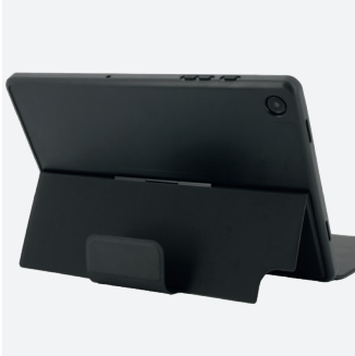
Tripod with multiple inclinations