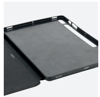
Flexible TPU case