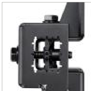
Integrated adjustment guides for straightforward alignment