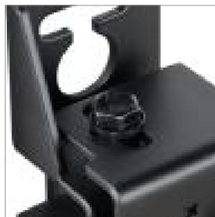
Keyhole mounting allows for easy installation