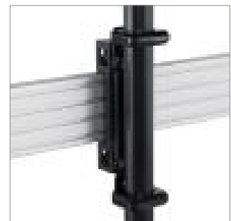
Can also be pole mounted using B-Tech accessory collars