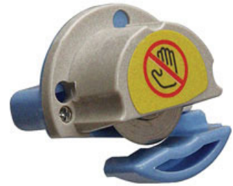
image PROGRAF W8400 CT-04 Cutter Blade

Product name : CT-04 Cutter Blade for image PROGRAF W8400