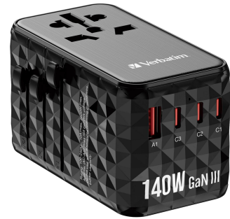
Universal Travel Adapter 140W Output Mode