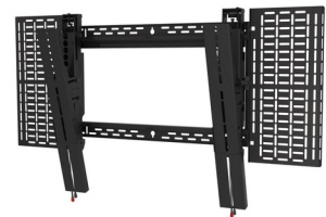
(2) ACC-UCM Universal Component Mounts shown with SmartMount® Universal Scissor Wall Mount (STS650)