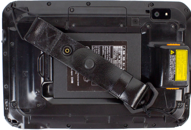
Shown in optimal orientation

PAN NA Part#: TBD Manufacturer Part #: TBCS1DURA-P