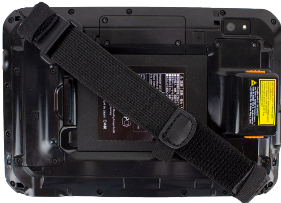
Shown in optimal orientation