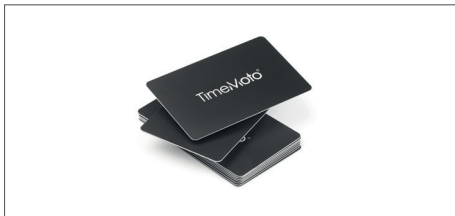
TimeMoto RF-100 set of 25 RFID badges Art. no: 125-0603