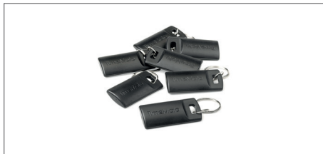
TimeMoto RF-110 set of 25 RFID key fobs Art.no: 125-0604