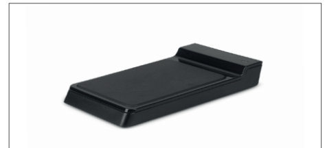
TimeMoto RF-150 USB RFID Reader Art. no: 125-0605