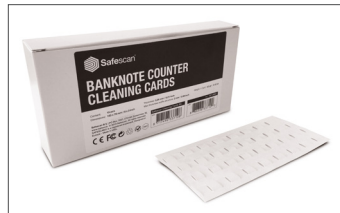
Safescan Cleaning Cards Art. no: 152-0663