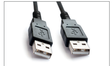
Safescan USB Cable Art. no: 124-0458