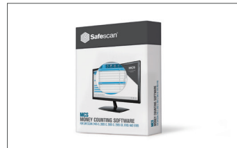
Safescan MCS Software Art. no: 124-0500