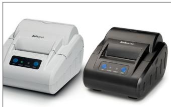
Safescan TP-230 Thermal Printer Art. no: 134-0475 Grey Art. no: 134-0535 Black