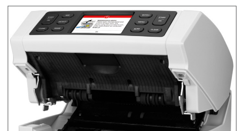
Internal parts and sensors can easily be cleaned by opening the top panel