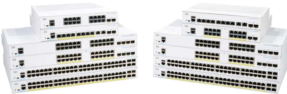
Figure 2. Cisco Business 350 series managed switches

The Cisco Business 350 Series Switches, part of the Cisco Business line of network solutions, is a portfolio of affordable managed switches that provides a critical building block for any small office network. Intuitive dashboard simplifies network setup, and advanced features accelerate digital transformation, while pervasive security protects business critical transactions. The Cisco Business 350 Series Switches provide the ideal combination of affordability and capabilities for small office and helps you create a more efficient, better-connected workforce. When your business needs advanced networking features and security for the digital transformation yet value is still a top consideration, you're ready for the Cisco Business 350 Series Switches.