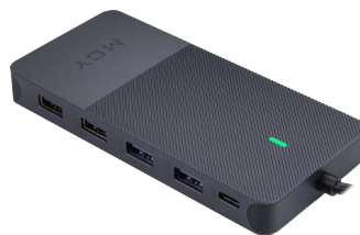
CNC Aluminium Case