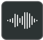
Optima Audio Experience