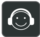
All Day Wearing Comfort