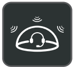
Acoustic Shield Technology

The Yealink WH62 is a new entry-level DECT wireless headset, with WH62 Dual and WH62 Mono two models. Work seamlessly with major UC platforms and integrate natively with Yealink IP phones. For crystal sound experience, Yealink Super Wideband Technology and Acoustic Shield Technology make you talk and hear clearly during phone calls and video conferencing. With easily on-ear control, interruption free, comfortable wearing, WH62 is a nice partner either for communicating or collaborating.