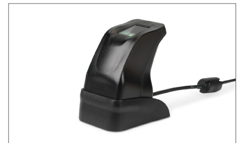
TimeMoto FP-150 USB Fingerprint Reader Art.no: 125-0606