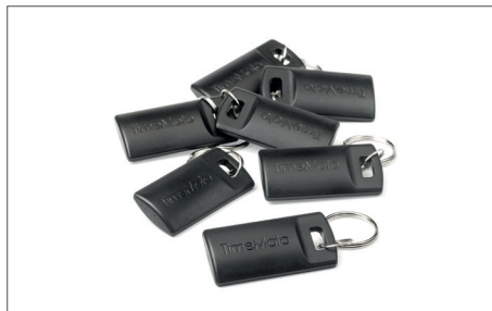
TimeMoto RF-110 set of 25 RFID key fobs Art.no: 125-0604