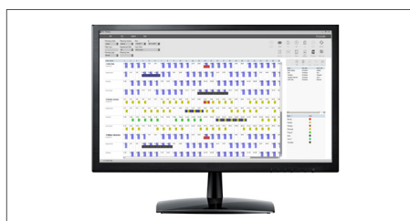
TimeMoto desktop software for single PC use included