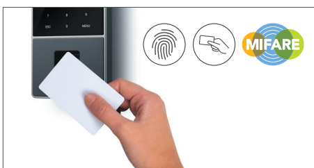
Clocking with Mifare and RFID proximity card, Fingerprint or PIN code