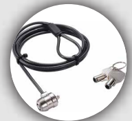
Sturdy security lock and cable