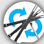
Tilting screen for easy register and customer-side transactions