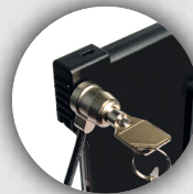
Anti-Theft lock with key