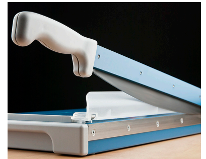
The ground, self-sharpening cutting blade produces a clean, burr free cut.