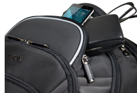
SECURE RIGID CASE FOR GLASSES & ACCESSORIES POCHE RIGIDE : PROTECTION POUR LUNETTES / SMARTPHONE