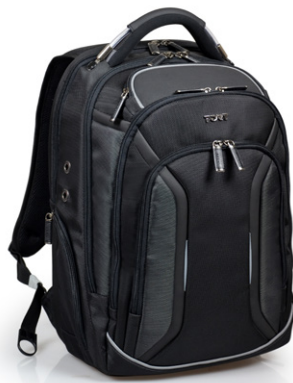
15,6" LAPTOP & 10" TABLET COMPARTMENTS