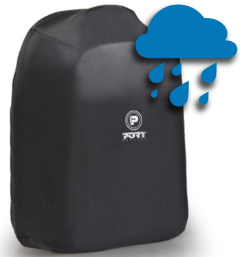
REMOVABLE WEATHER RESISTANT RAIN COVER