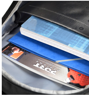
A4 DOCUMENT COMPARTMENT