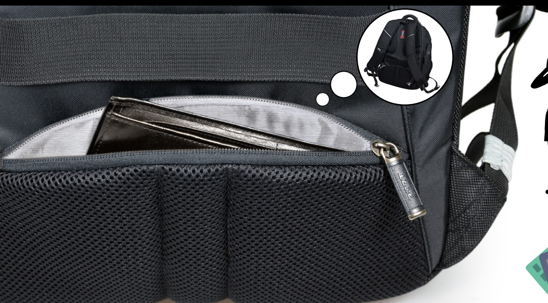
Back RFID safe pocket : blocks RFID waves Poche dorsale anti-RFID : bloque les ondes RFID