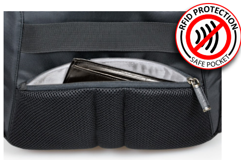
ANTI-HACKING RFID SECRET POCKET POCHE SECRETE ANTI-PIRATAGE RFID