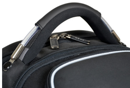
COMFORTABLE HIGH RESISTANCE HANDLE POIGNEE CONFORTABLE HAUTE RESISTANCE