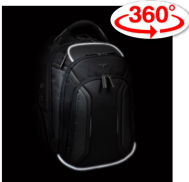
SAFE AT NIGHT 360° : VISIBILITY LIGHT REFLECTIVE BANDS