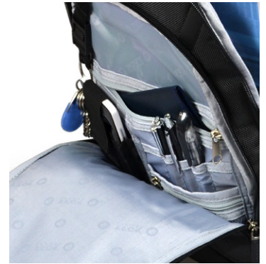
LARGE ORGANIZER POCKET FOR ACCESSORIES