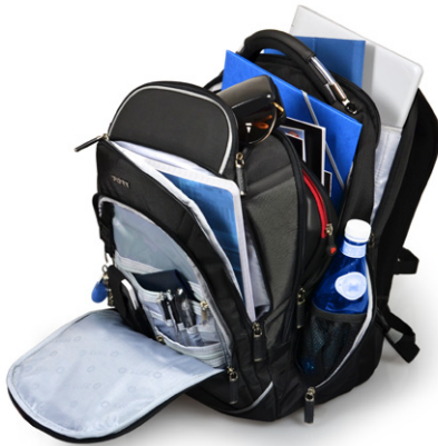
3 COMPARTMENTS 25 LITERS CAPACITY