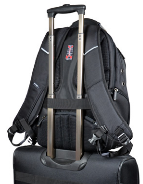
TROLLEY STRAP FOR ROLLING LUGGAGE HANDLES