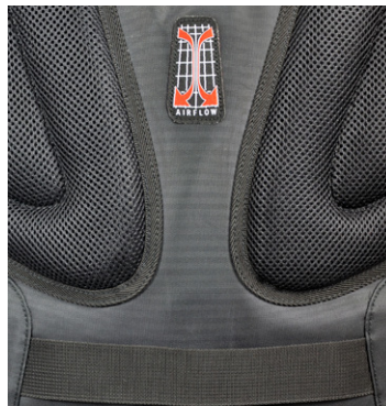
COMFORTABLE PADDED BACK WITH AIR FLOW SYSTEM