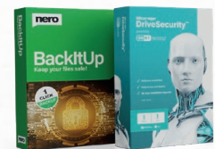
Free 1 year license of Nero BackItUp and iStorage DriveSecurity