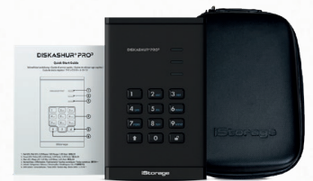
diskAshur PRO 3 portable HDD/SSD, Carry Case and Quick Start Guide