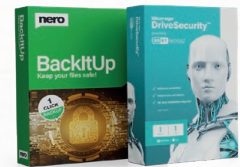
Free 1 year license of Nero BackItUp and iStorage DriveSecurity