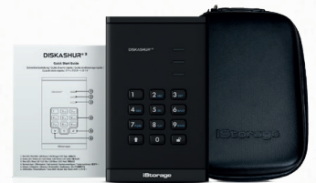
diskAshur 3 portable HDD/SSD, Carry Case and Quick Start Guide