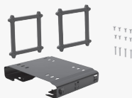
HP Desktop Mini v4+ VESA Sleeve

Wrap your HP Desktop Mini PC in the HP Desktop Mini v4+ VESA Sleeve to securely mount it—with or without an Expansion Module 1,2 —behind your display, position the solution on a wall, and lock it down with the integrated security bracket and optional HP Ultra-Slim Cable Lock.