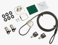
HP Business PC Security Lock v3 Kit

Help prevent chassis tampering and secure your PC and display in workspaces and public areas with the affordable HP Business PC Security Lock v3 Kit.