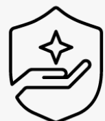
3-year pickup and return U4819E