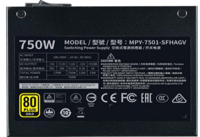
80 PLUS Gold Certified