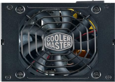
Quiet FDB Fan