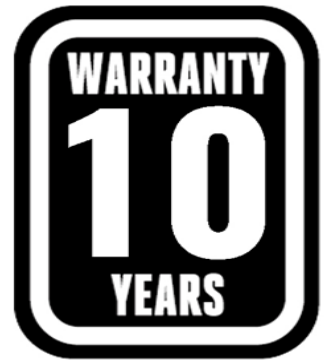
10 Year Warranty