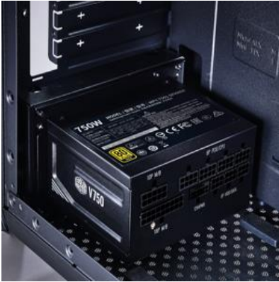
SFX Form Factor