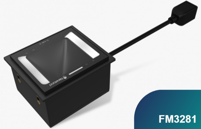
FM3281 Grouper Stationary Scanners