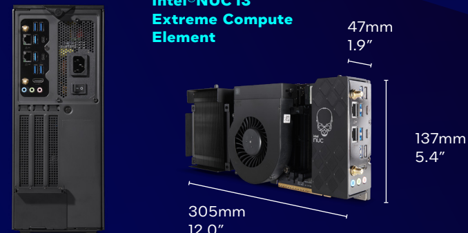
Intel® NUC 13 Extreme Compute Element