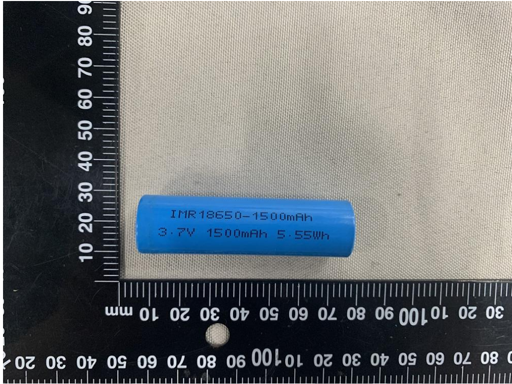
Cell (IMR18650-1500mAh, 3.7V, 1500mAh, 5.55Wh)