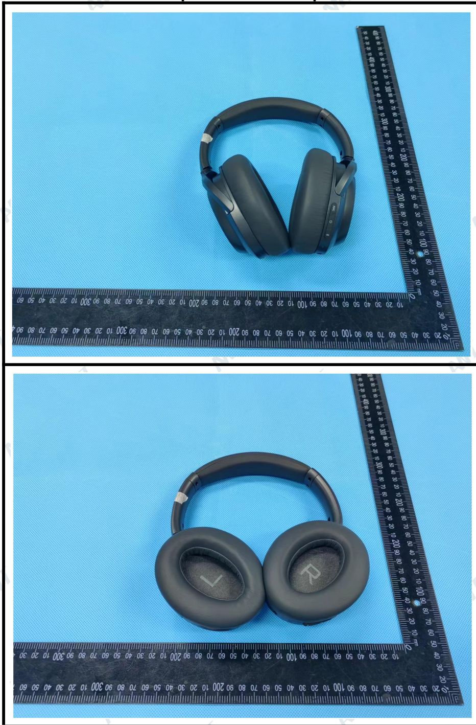
The photo of the sample