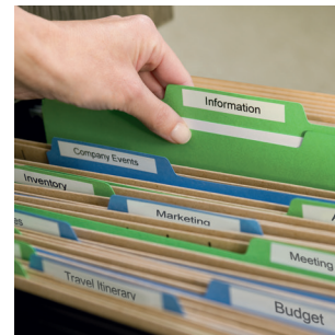
Files and folders