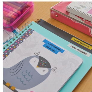
Crafts & Creative