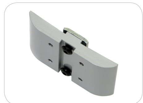
T-Slot Bracket 60-575-003