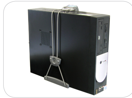
Universal CPU Holder 80-105-064