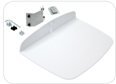
Utility Shelf 97-507-216