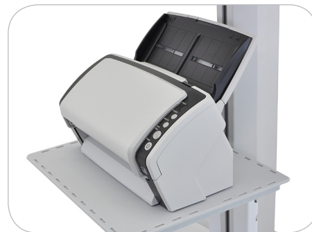
SV cart with scanner/printer placed on Ergotron's Large Utility Shelf 97-540-053 and attached with the T-Slot Bracket 60-575-003

© 2012 Ergotron, Inc. rev. 02/28/2012 Content is subject to change without notification