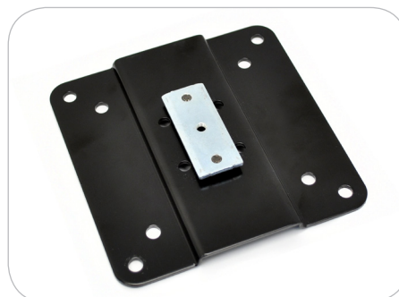
SV Rear VESA Mount Kit 97-512-009