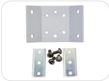
Interface Bracket Kit 60-587-207