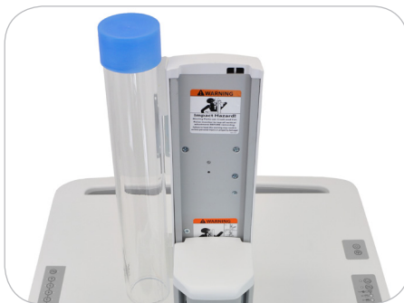
SV cart with medication cup dispenser adhered to 5" lift