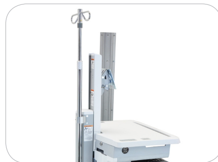
SV cart with IV Pole attached via Ergotron's StyleView IV Pole Clamp Kit