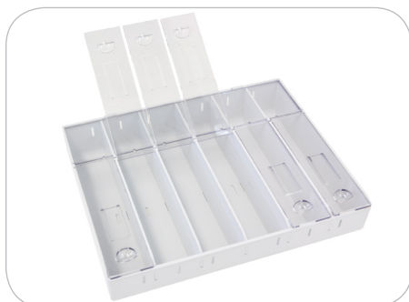
StyleView Medical Drawer Tray Accessory 97-450