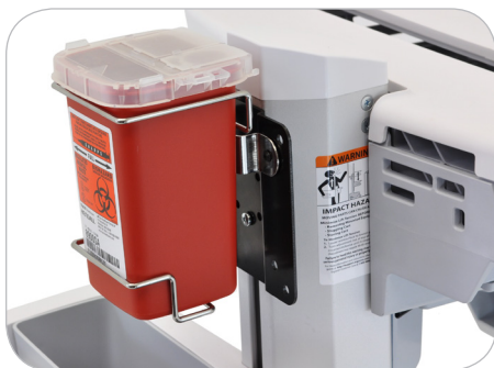
SV cart with small Sharps container and wall mount bracket attached via Ergotron's VESA Mount Kit 97-512-009