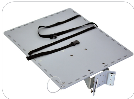
Large Utility Shelf 97-540-053