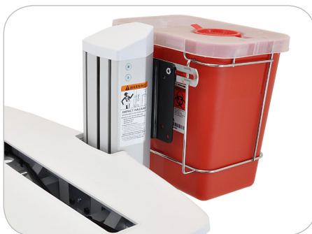
SV cart with large Sharps container (5 quart) and wall mount bracket attached via Ergotron's VESA Mount Kit 97-512-009