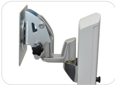
SV Cart LCD Pan Pivot Kit 97-650