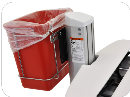
SV cart with waste basket (5 quart) and wall mount bracket attached via Ergotron's VESA Mount Kit 97-512-009