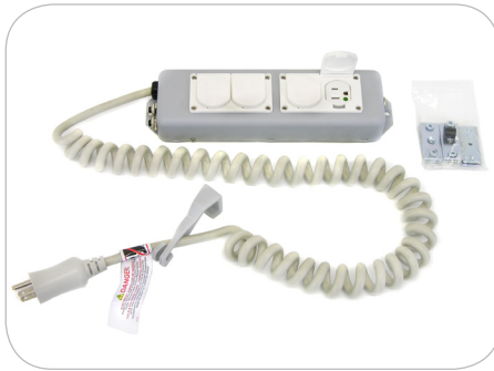
Medical-Grade Power Strip 97-466-214 (Available North America)