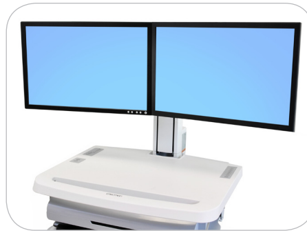
SV Dual Display Kit 97-574